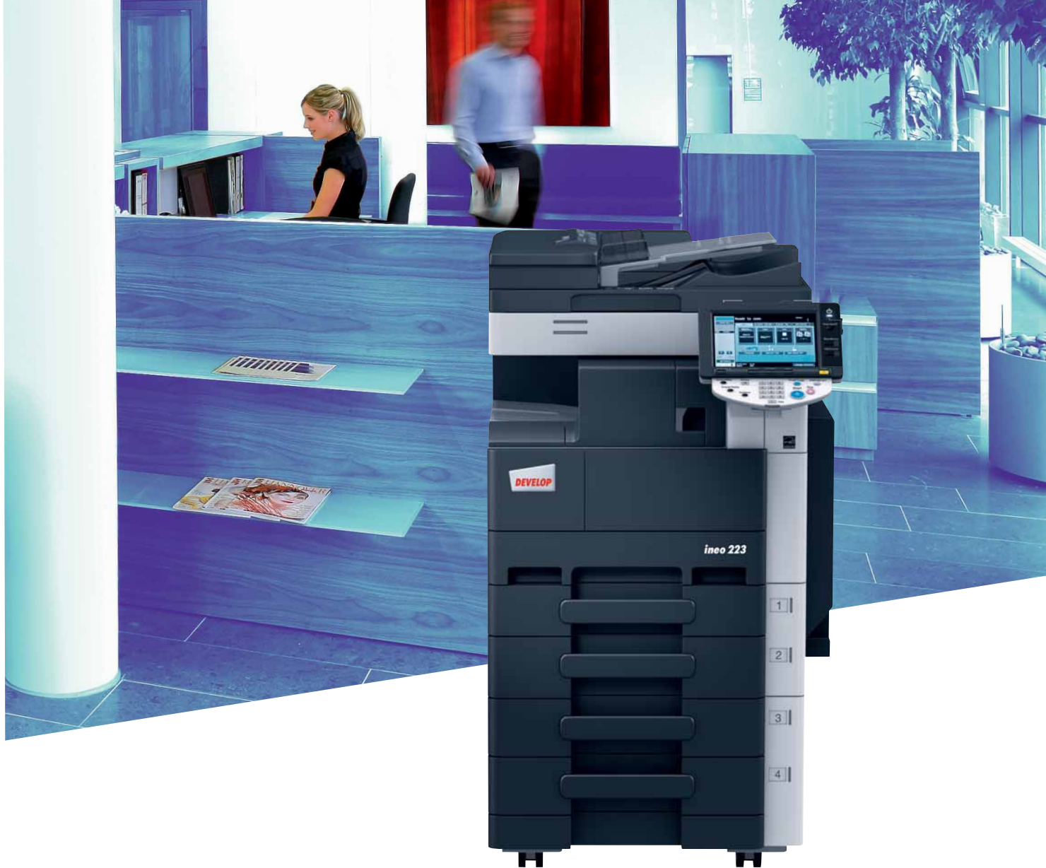
ineo 223 with embedded finisher (FS-529), paper cassette (PC-208) and document feeder (DF-621)