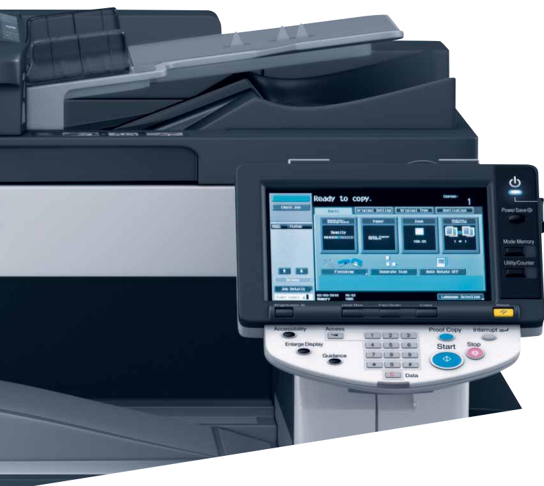
ineo 223's easy to use colour touchscreen display

The high print quality combined with a wide range of finishing functions allow professional office documents like brochures to be printed inhouse. Add to that the ability to punch and staple and office productivity will be enhanced even more.