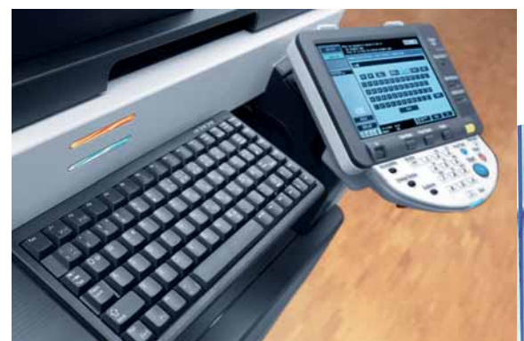
ineo 223 colour touchscreen display and the optional keyboard

A perfect team: Profit from the ineo 223 for all your monochrome printing and copying while the ineo+ colour systems guarantee professional colour output – a cost-efficient combination for high-quality office document production.