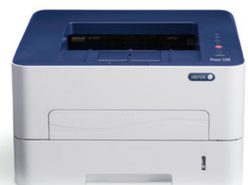
Phaser 3260. Print.