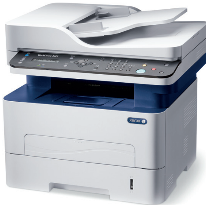
WorkCentre 3225. Copy. Print. Scan. Fax. Email.