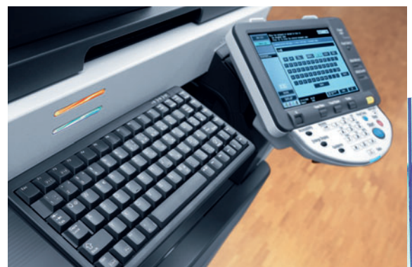
ineo 423 colour touchscreen display and the optional keyboard

A perfect team: Profit from the ineo 423 for all your monochrome printing and copying while the ineo+ colour systems guarantee professional colour output – a cost-efficient combination for high-quality office document production.