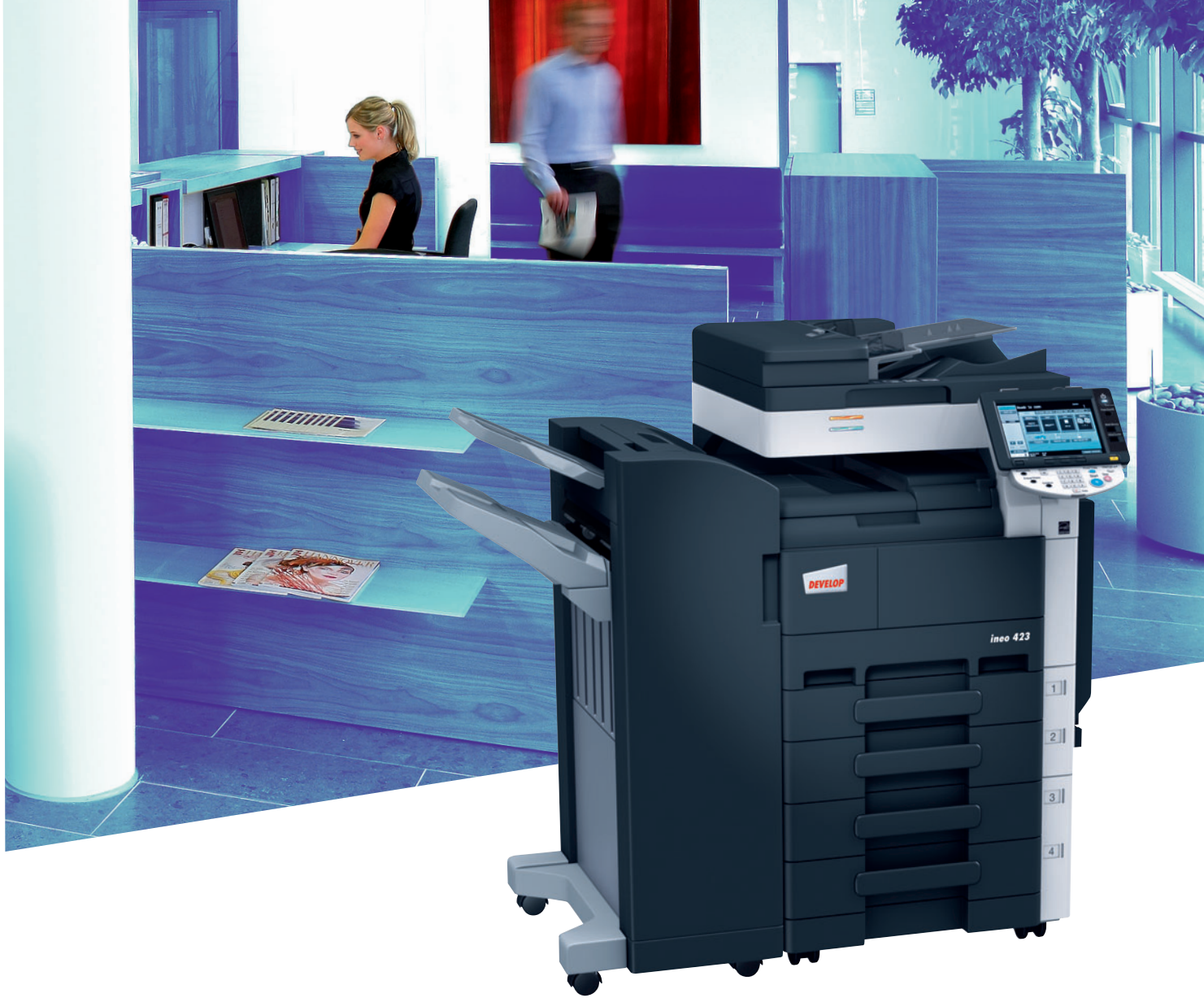
ineo 423 with floortype finisher (FS-527) and paper cassette (PC-208)