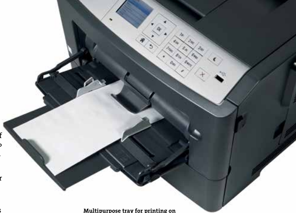
Multipurpose tray for printing on special media such as envelopes

Are high-volume print jobs commonplace in your business? With a maximum capacity of 2,300 sheets you can be sure that the ineo 4700P will not run out of paper. And if you frequently print on different kinds of paper, e.g. with or without your corporate logo, you can have your ineo 4700P equipped with up to three paper trays (with 250 or 550 sheets). If the trays are stocked with different kinds, sizes and weights of paper (A6–A4 and 60–163 g/m 2 ), you ensure your staff to waste no time switching from one kind of paper to another, or running back to a printer that has run out of paper.