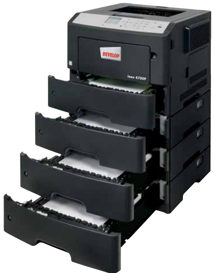
ineo 4700P with three additional paper cassettes (PF-P12)

If the operating system on your current printer is frustratingly difficult to follow and the device difficult to use, it's time you considered switching to an ineo 4700P. Its 2.4-inch colour display ensures intuitive operatability and highlighted menus show users the system's status, operating options and settings. What's more, a folder-like navigation concept means the ineo 4700P is easier to use than many older systems. This saves your staff time and effort in everyday printing jobs. And nobody will have to consult an operating manual before using this new printer.