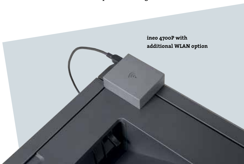
ineo 4700P with additional WLAN option