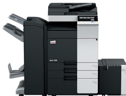
ineo+ 258 with dual scan document feeder (DF-704), staple/booklet finisher (FS-534SD), large capacity tray (LU-302) and paper feeder (PC-410)