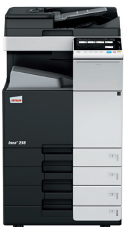
ineo+ 258 with dual scan document feeder (DF-704), output tray (OT-506) and paper feeder (PC-210)

Invest in an ineo+ 258 and you will no longer be dependent on external shops for specialist jobs such as invitations printed on thick, high-quality paper. That will save you time and money. The ineo+ 258 can handle envelopes, recycled paper, pre-printed paper, overhead transparencies, many other media and even thick card of up to 300 g/m 2 . These systems can print broad range of paper formats from A6 to A3+ (SRA3) or user-defined formats and banners of up to 1.2 metres in length. What's more, the numerous finishing options allow booklets of up to 80 pages to be created, letters folded in various ways, handouts stapled or invoices hole-punched. Almost any job can be produced in-house on an ineo+ 258.