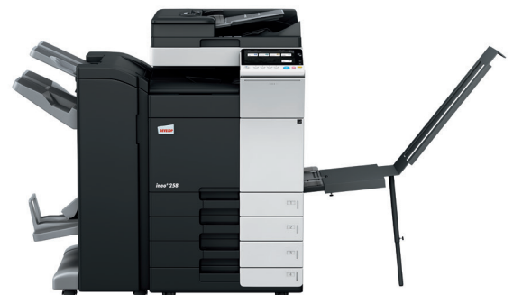
ineo+ 258 with dual scan document feeder (DF-704), staple/booklet finisher (FS-534SD), banner tray (BT-C1e) and paper feeder (PC-210)