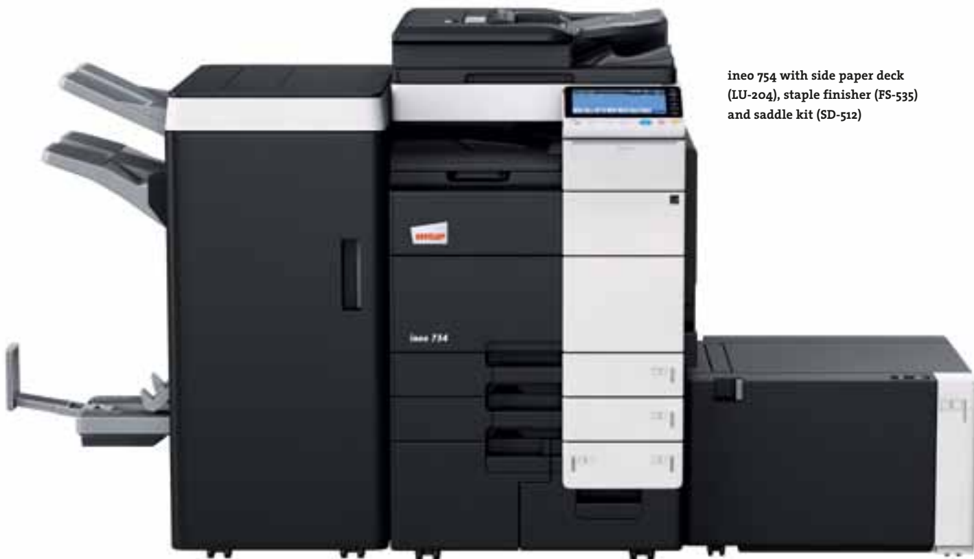
ineo 754 with side paper deck (LU-204), staple finisher (FS-535) and saddle kit (SD-512)

Viruses, Trojan horses, hacker attacks: these days, no business can afford to ignore the challenging issue of IT security. That's why the ineo 754 is certified to ISO 15408 EAL 3, the industry's security standard for multifunctional systems. What's more, it also comes equipped with numerous data-security features such as IPsec encryption, which ensures secure communication channels for all documents passing through your company's network. There is no danger of confidential documents or data getting into the wrong hands either since access to the system can be restricted to authorised users by means of the standard hard-disk encryption kit and authentication technology. This way, we ensure your sensitive data stay secure – now and in future.