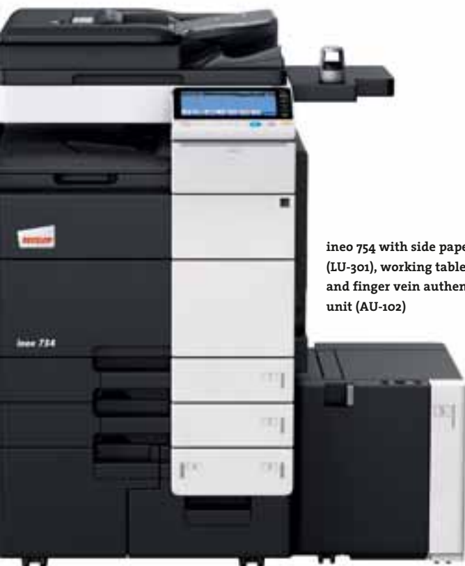
ineo 754 with side paper deck (LU-301), working table (WT-506) and finger vein authentication unit (AU-102)

The ineo 754 prints and copies at 75 A4 pages per minute (ppm). That means your staff can leave this machine to get on with any high-volume job while they carry on with their daily office work. In the multi-user environment of a departmental device or centralised office location and at an in-house printshop, this will also eliminate job queues, or at least shorten waiting times. Since this machine prints or copies in duplex mode at full speed, it will also save you money by reducing your paper consumption on high-volume jobs.