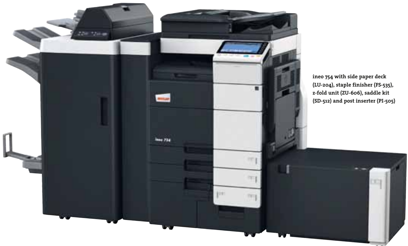
ineo 754 with side paper deck (LU-204), staple finisher (FS-535), z-fold unit (ZU-606), saddle kit (SD-512) and post inserter (PI-505)